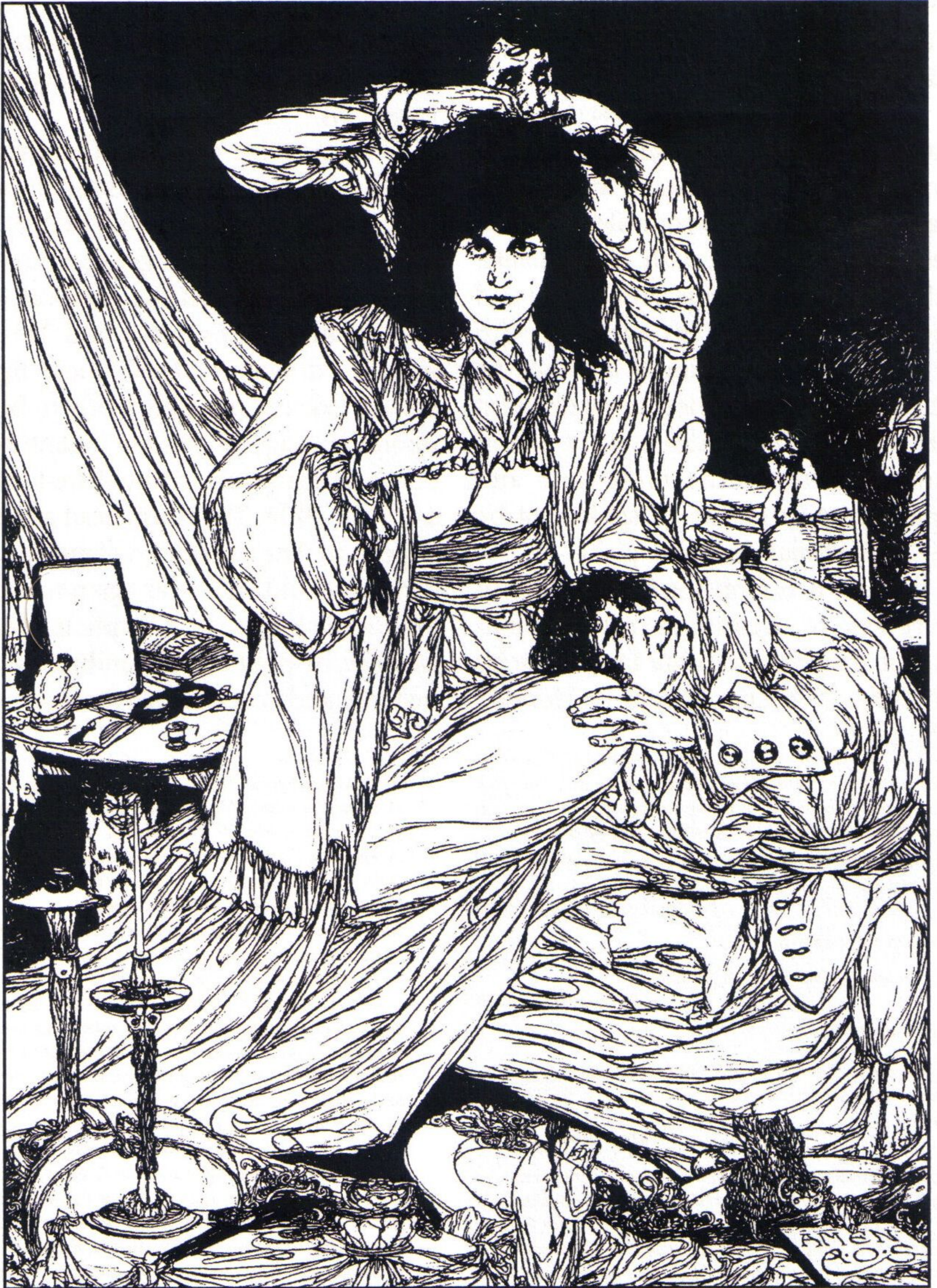
The Beauty Doctor